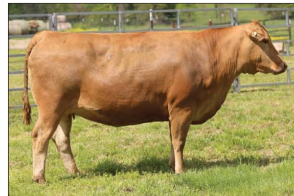
Dam, HeartBrand 5577J