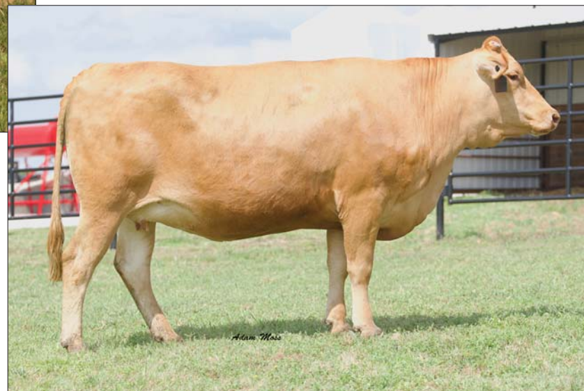
Dam, BRW Kinochi 017E ET