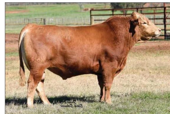
Sire, HeartBrand Hercules 2619A