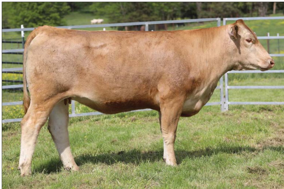
Dam, Ace Ms Triple Crown 222 ET