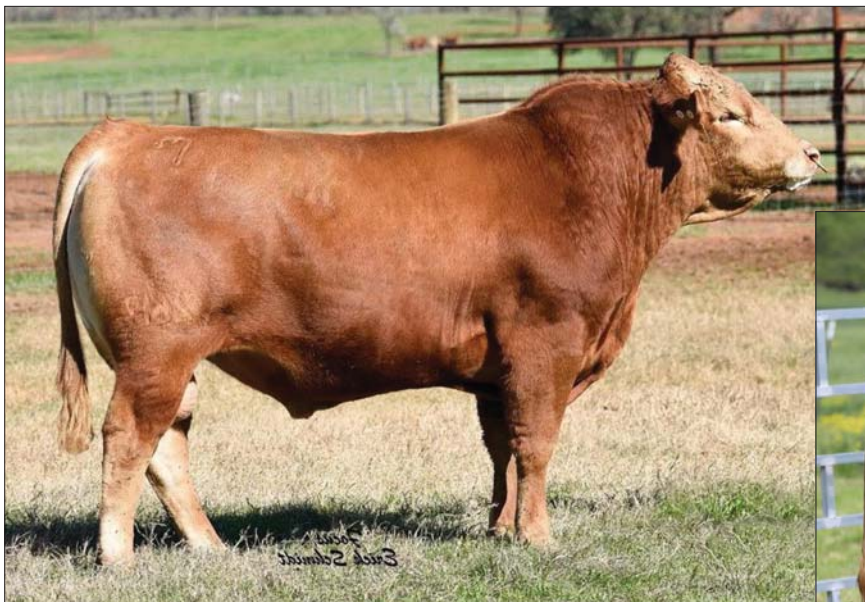
Sire, HeartBrand Hercules 2619A