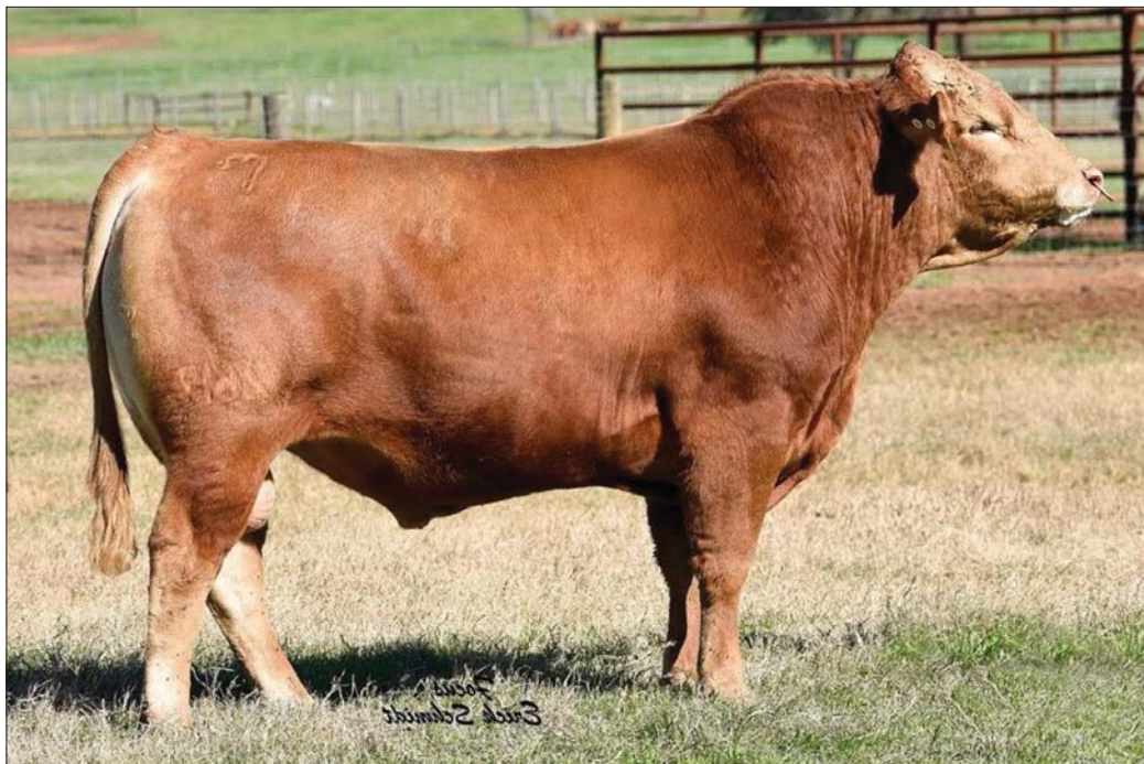
Sire, HeartBrand Hercules 2619A