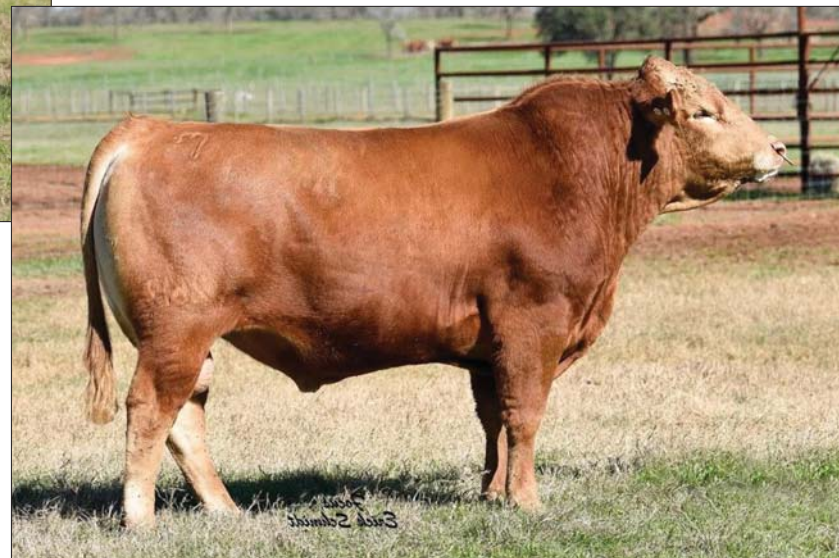
Sire, Heartbrand Hercules 2619A