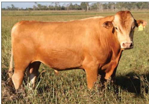
Sire, SUMO Cattle Co Tamamaru 406