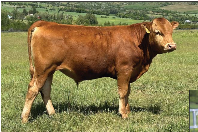
Sire, CGX Star Lord 3323L