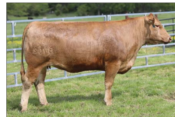
Dam, HeartBrand 3762H