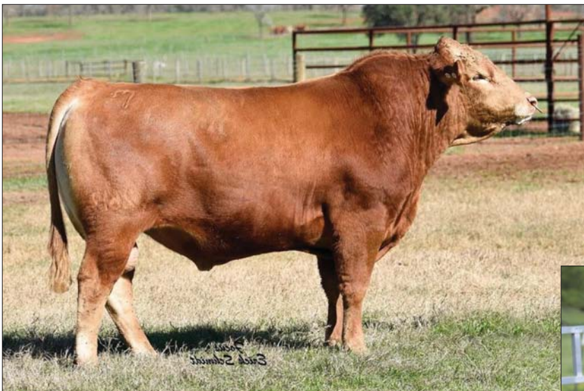
Sire, HeartBrand Hercules 2619A