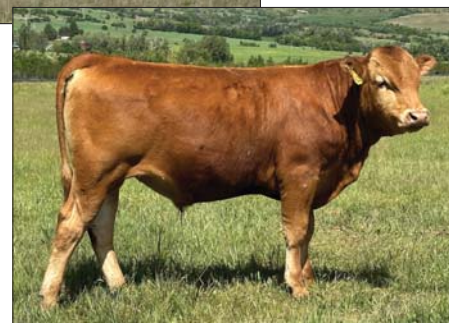
Sire, CGX Star Lord 3323L