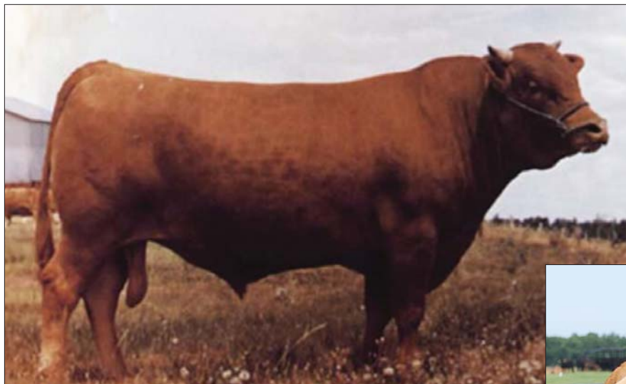
Sire, Rueshaw 430