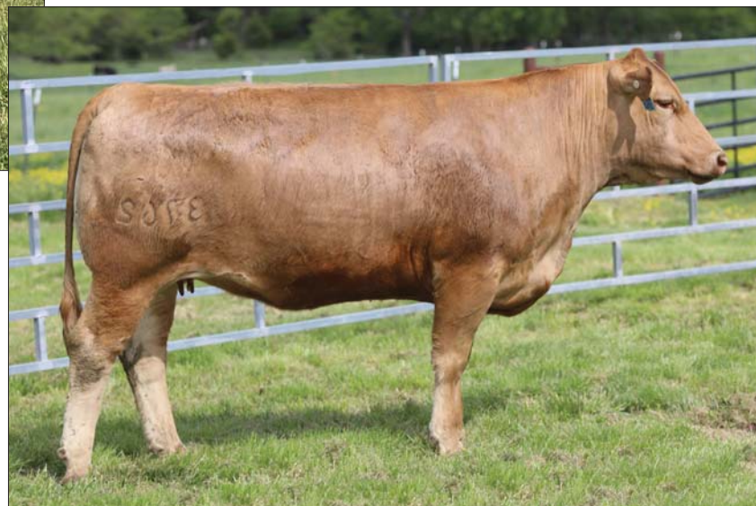
Dam, HeartBrand 3762H