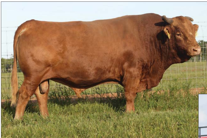
Sire, Big Al