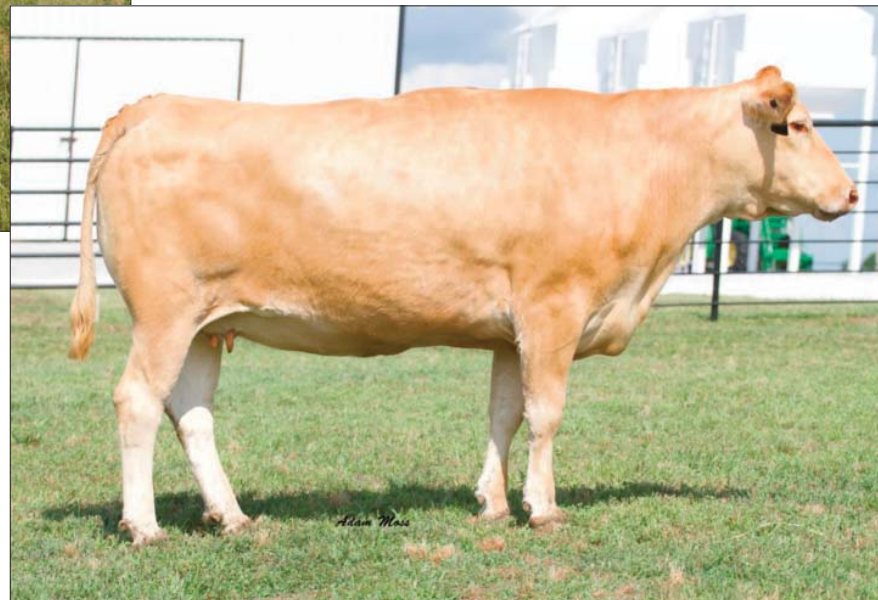
Dam, JC Shigekari 129