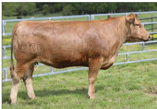
Dam, HeartBrand 3762H