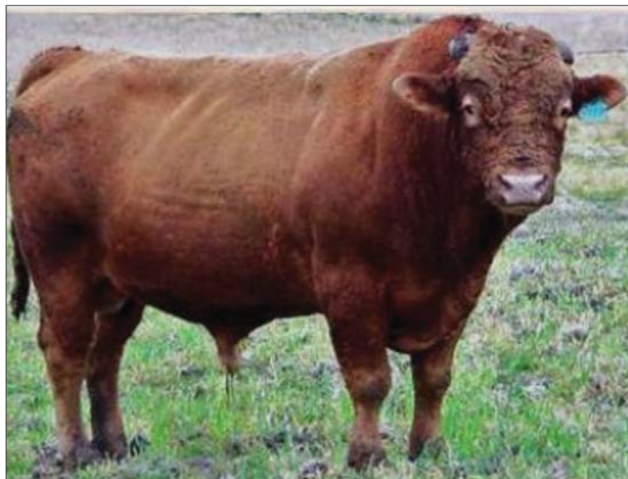
Sire, HeartBrand Red Emperor