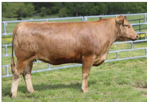
Dam, HeartBrand 3762H