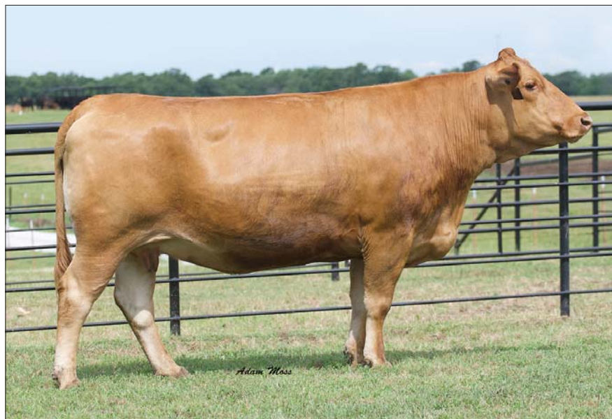
Dam, RMW Hoshiko D18